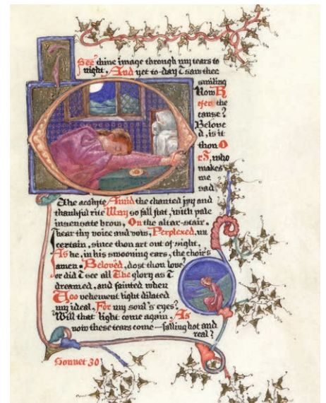
Phoebe Anna Traquair's illuminated copy of Elizabeth Barrett Browning's 'Sonnets from the Portuguese' Sonnet 30

one of the UK's best Burns' Night events by The Telegraph. As a result of this interest, the Wikimedian in Residence at the National Library of Scotland has been invited to speak to other GLAM and Information Professional organisations at events like the 2014 EDGE Conference in Edinburgh and the Swiss National Library's 2014 Library Science Talks, and by organising workshops with Special Libraries Association Europe and JISC Scotland among others.