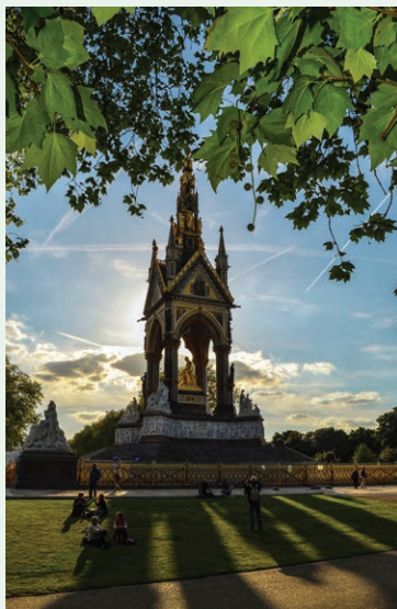
Albert Memorial in Kensington Gardens