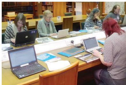
Editing at Anybody But Burns

ScotWiki volunteers have expanded the Wikimedia community by working with local open knowledge networks like the Open Knowledge Foundation Scotland and the Digital Humanities Network Scotland. The collaboration has captured both national and global attention; events and editathons are growing in their size and reach, something that was particularly evident with January's Anybody But Burns Editathon, which was declared