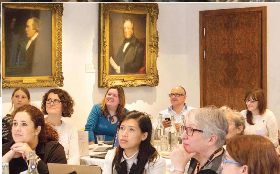
A training session at the Royal Society