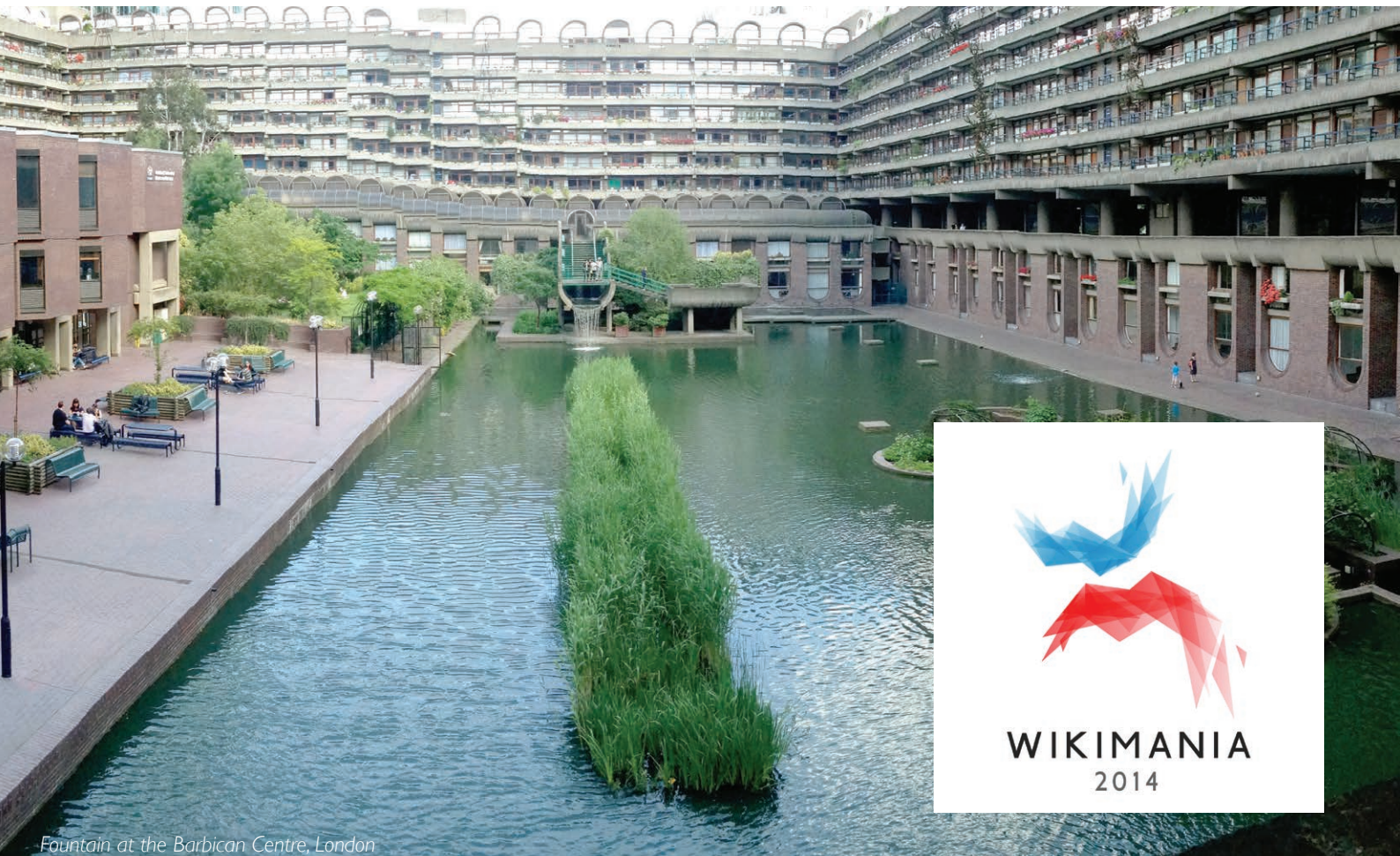
Fountain at the Barbican Centre, London