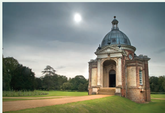
Wrest Park Banqueting House