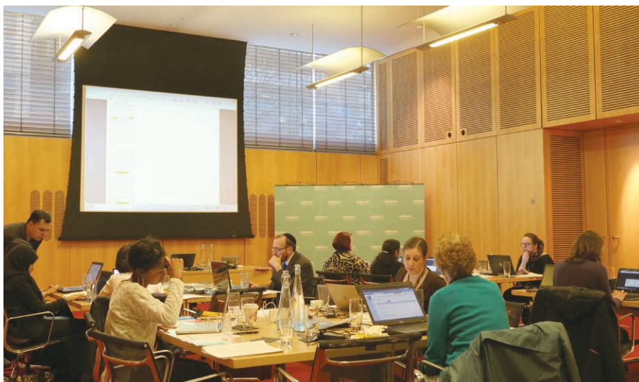
An editathon at the Wellcome Library arranged as part of the project