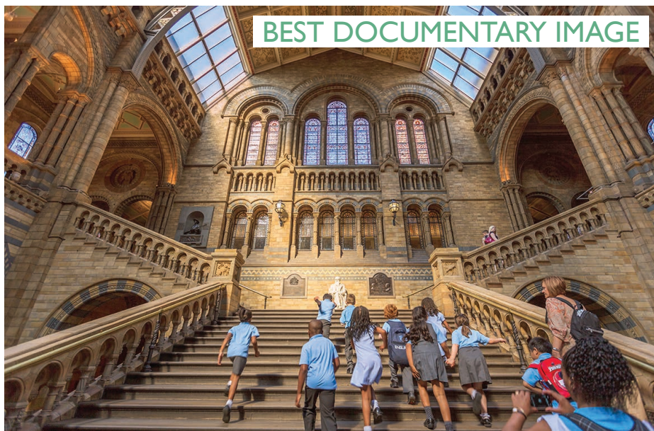
Natural History Museum, UK

Preparations are in motion for September 2014, and one of the people who uploaded their first picture as part of Wiki Loves Monuments last year is now part of the organising team. We're looking forward to seeing another collection of fabulous photos.