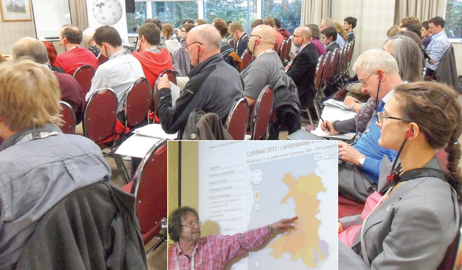
Live translation at the EduWiki Conference