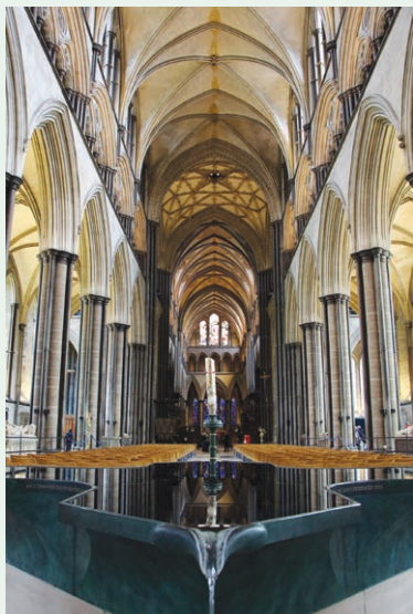
Salisbury Cathedral Columns