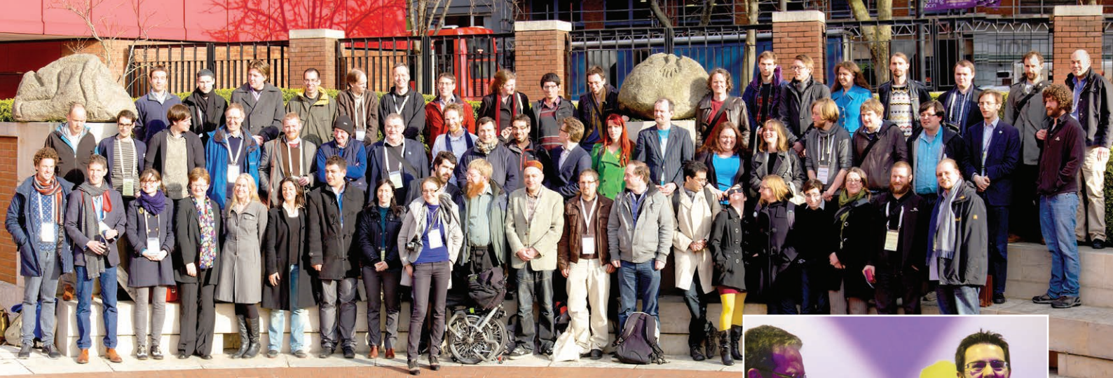
GLAM-Wiki 2013 participants