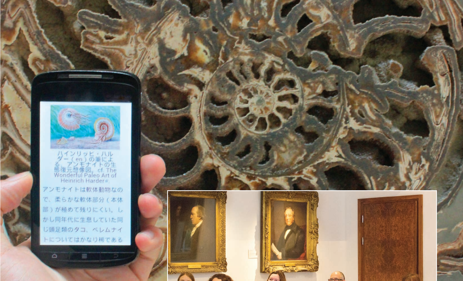
The Natural History Museum is making information available to users in their own language