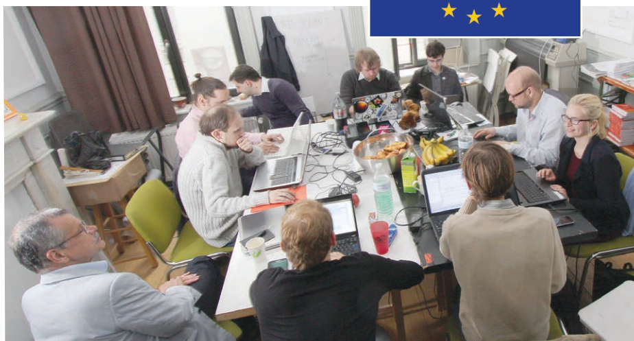
Members of the Free Knowledge Advocacy Group EU hard at work

Absence of Freedom of Panorama in France means that you can't use images of the European Parliament – something we are working to change