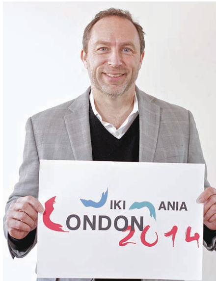
Jimmy Wales in support of Wikimania 2014 London

There's a lot to cover, so the conference has been broken down into several themes.