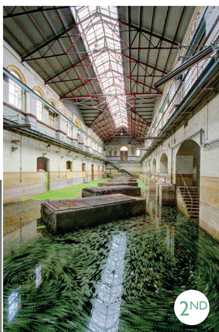
Bottom: Monument to the fallen soldier (first place in Wiki Loves Monuments UK). Left: C Station Pump House (second place). Right: the Tulip Stair (3rd place)

A picture is worth a thousand words, or so the old saying goes. Wikimedia is about more than just text. Illustrations – especially of historic buildings – are incredibly important. The competition offered an excuse, as if one is ever needed, to go out and explore the UK's heritage. For Wikimedia UK the impact is plain: nearly 700 people uploaded pictures of the UK, with some really impressive results. They varied from national icons such as Edinburgh Castle or the Houses of Parliament, to history of the lesser known variety, such as tombstones in London.