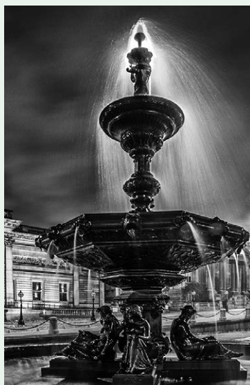
Stable Fountain Liverpool