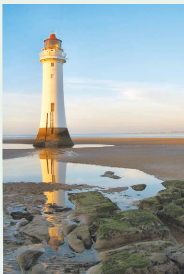
Fort Perch Rock Lighthouse