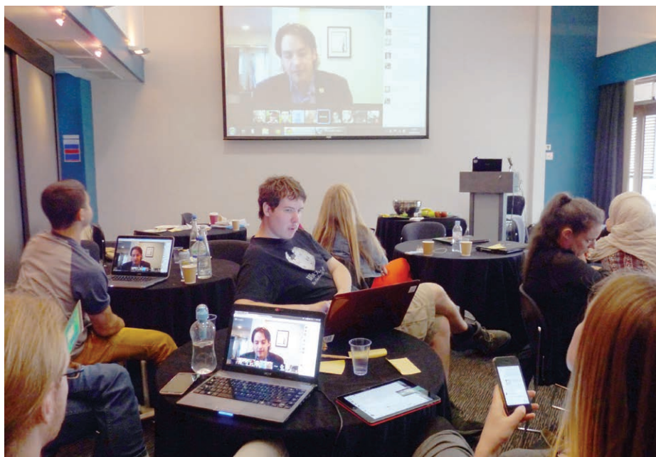
Social Machines, Wikimania 2014

The amount of data that the world produces is vast. But how can we put it to good use? Rufus Pollock, co-founder of the Open Knowledge Foundation, will explore this idea in his keynote. Open data can help us address all kinds of challenges, from finding the quickest route to work to dealing with climate change. But data collection also has implications for our privacy and security. The items in this theme address the 1s and 0s of all things open data.