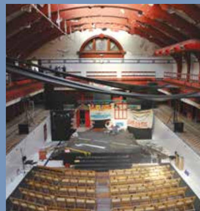
Govanhill Baths, Glasgow