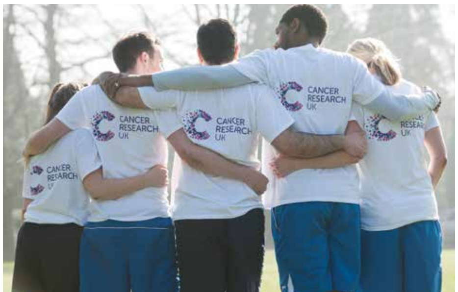
An image from the CRUK project