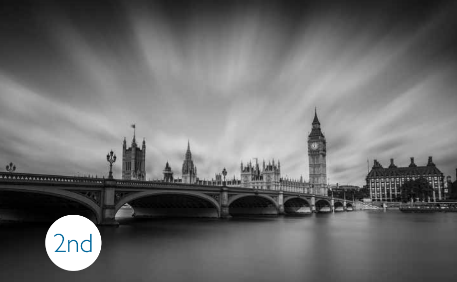
Houses of Parliament and Westminster Bridge, London by Fuzzypiggy