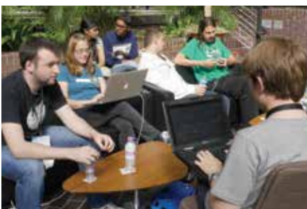
Wikimania attendees in the Barbican Conservatory

All credit and thanks must go to the dedicated, hard-working volunteers who made this extraordinary event happen.