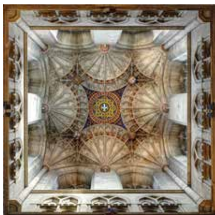
Roof of Bell Harry Tower, Canterbury Cathedral