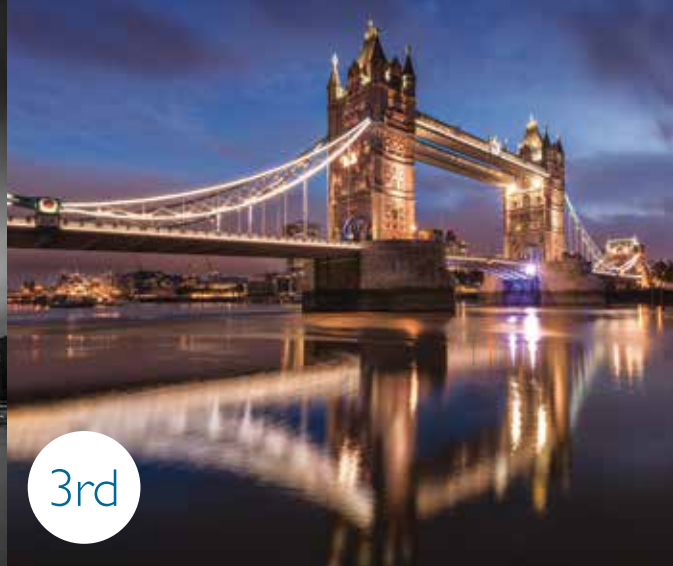
Tower Bridge at Dawn