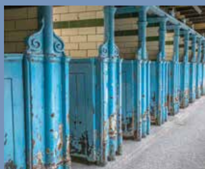
Victoria Baths, Manchester