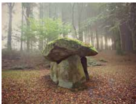
Dolwilym Burial Chamber (known as Arthur's Table or Gwal y Filiast)