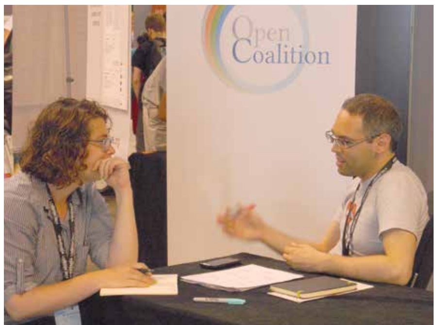
The Open Coalition stand at Wikimania

“Increasing understanding of open, leading to greater effectiveness and knowledge sharing across the sector”