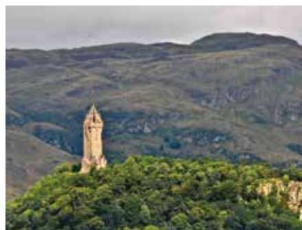
The National Wallace Monument, Stirling, Scotland