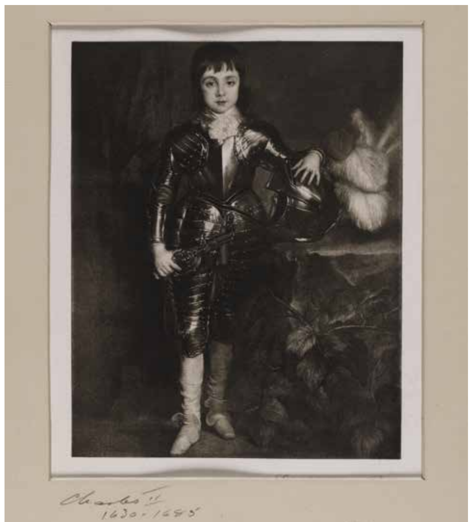
Jacobite broadside - Portrait of Charles II (1630-1685) as a boy