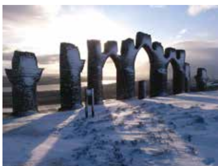
The Fyrish Monument in December by Reg Tait