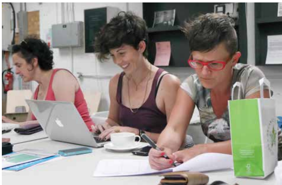
The Feminist Film editathon, July 2014

report summarising the activity. The genesis of this project was that in 2013 our editathons expanded and received extremely positive responses from the attendees and in general. They were organised with strong support from the Medical Research Council, which enabled us to deliver events in partnerships with other organisations who hosted them and invited people from their networks to attend. Since then we have been contacted by various organisations interested in collaborating with us further.