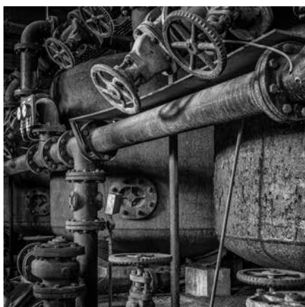
Victorian valves at Victoria Baths, Manchester