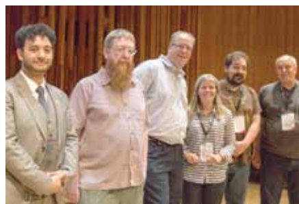
Winners of the UK Wikimedian of the Year 2014 awards