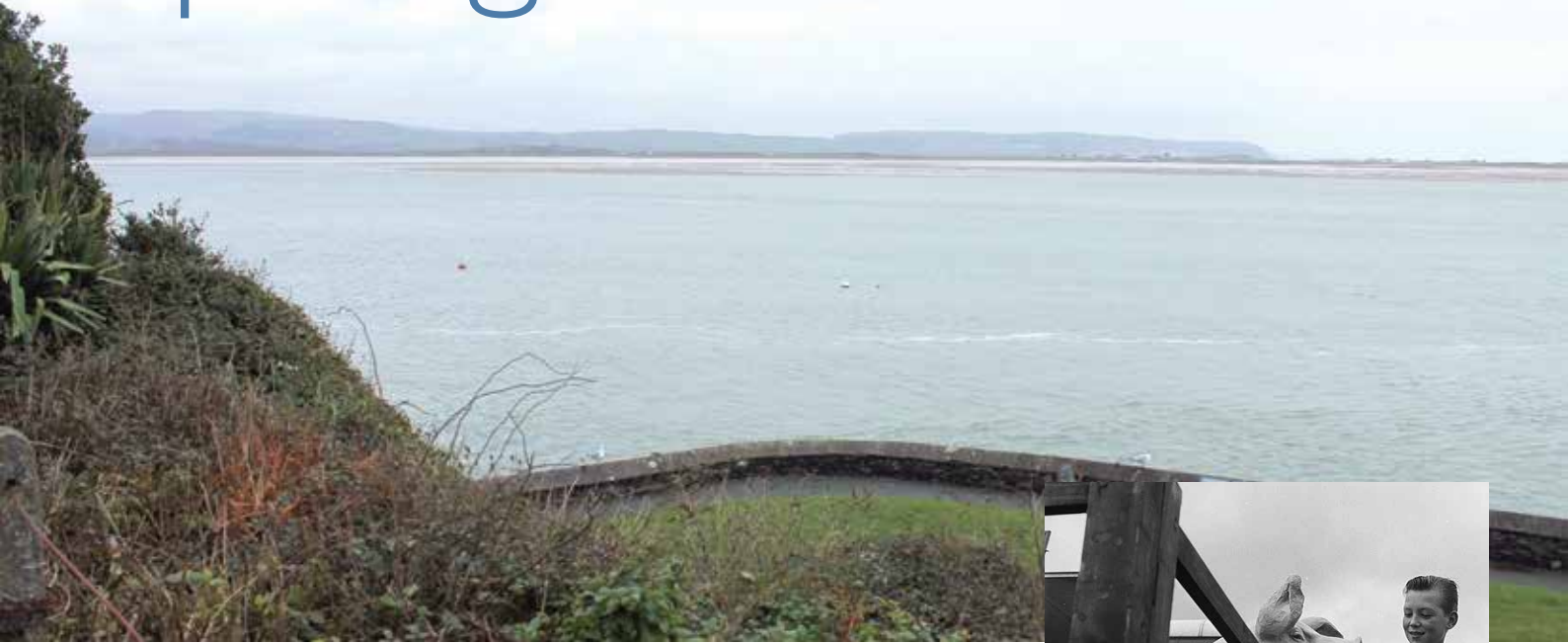
An image from the Living Paths! Llwybrau Byw! Project

It's been a very busy year in Wales with some great initiatives delivering significant benefits for open knowledge, particularly in the Welsh language.