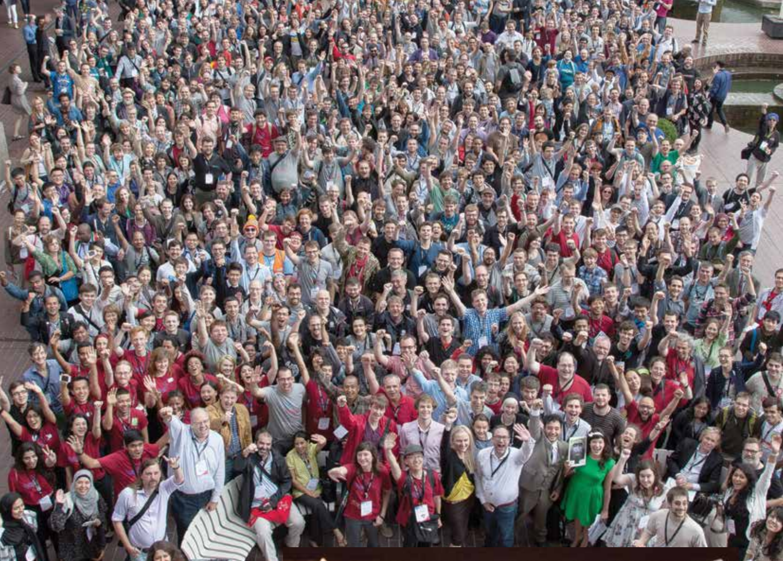
Wikimania 2014 group photo (above). Host of the closing ceremony (right). Wikimania 2014 volunteers (below)