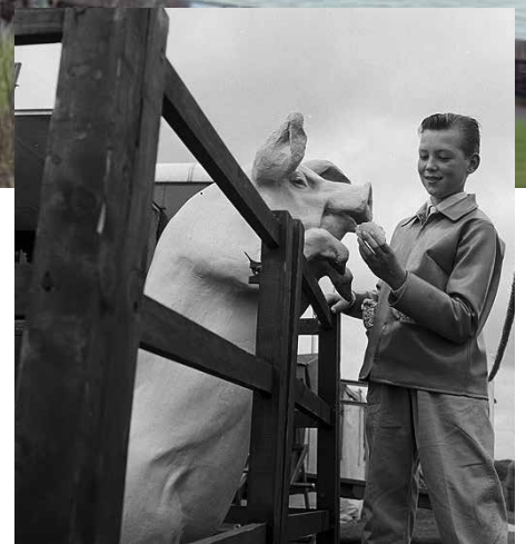
Anglesey Agricultural Show, 1963, from the National Library of Wales collection

The second key project in Wales is the growing relationship with the National Library of Wales. We were very fortunate to be able to appoint Jason Evans to this role and he has been doing an excellent job. Within six months of the project's launch images released by the NLW and uploaded to Commons have been viewed more than a million times. He has identified