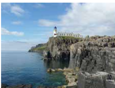
Neist Point Lighthouse by Lionel Ulmer