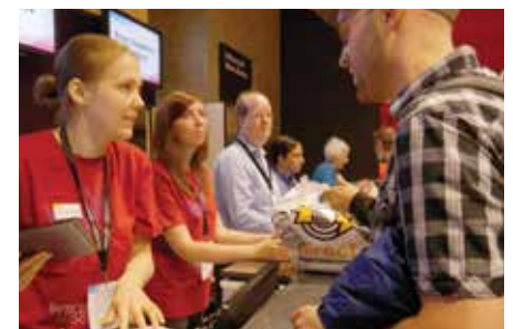
The registration desk at Wikimania 2014 at about 9am on day 1