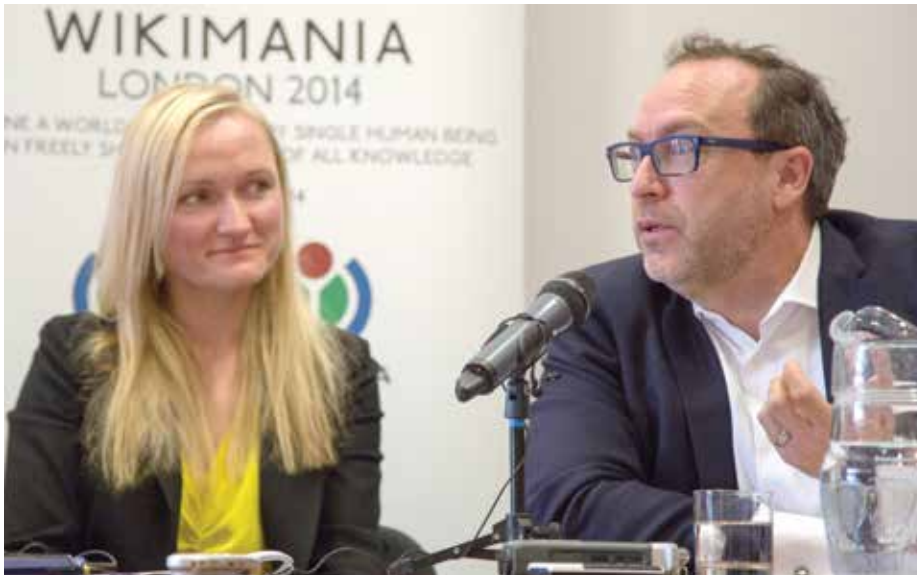
Wikimania 2014 Press Briefing

We were lucky enough to be the host chapter for Wikimania 2014 – the biggest in the history of the movement. Over the conference, the fringe and the pre-conference, more than 1,500 people attended the events at the Barbican in London from 59 countries, with several thousand more passing through the community village.