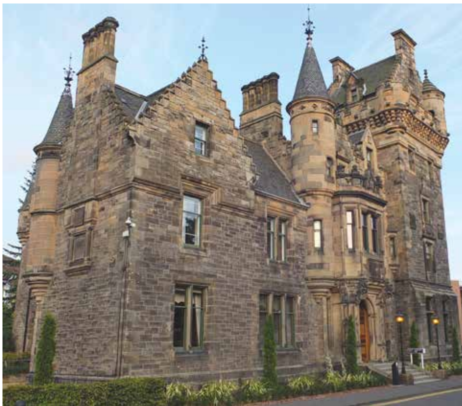
St Leonard's Hall, Edinburgh, venue for EduWiki

2014-15 saw our third annual EduWiki conference take place in Edinburgh. The event had a truly international flavour with delegates attending from 11 countries. This was a one-day event that raised awareness of the educational possibilities of Wikipedia and sister projects, developing Wikimedia UK's academic engagement. It brought together many of those in the Education sector who have benefited directly from our support over the years. Aside from presentations about case studies from across the UK, this event also offered an opportunity for others across the education sector to attend workshops for Educators and/or Campus Ambassadors, providing support for those using Wikipedia as a teaching platform.