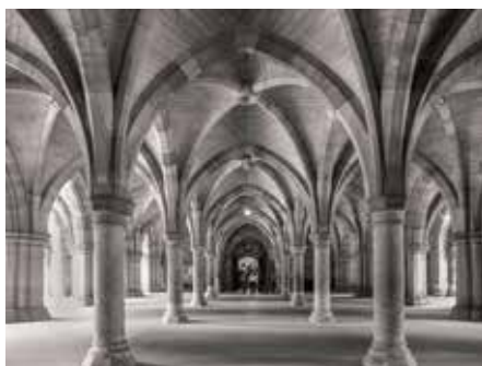
The Cloisters below Bute Hall, Glasgow University